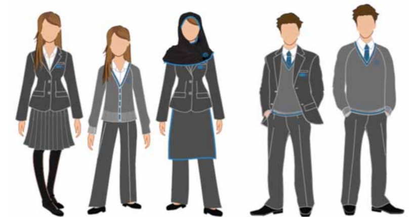
Key Stage 4 (Years 10 & 11)

Key Stage 3 (Years 7, 8 & 9): The ties, jumpers and blazers can be bought from Khalsa who currently supply our uniform. In September 2014 we expect all new students to wear the new uniform. All other students will have the option to remain in their current uniform until such time as they need to purchase new items. It will not be possible to 'mix and match' uniforms. Students should either be entirely in the 'old' uniform or entirely in the 'new' uniform.