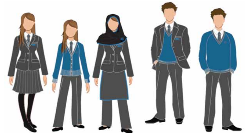
Key Stage 3 (Years 7, 8 & 9)

From September 2014, there will be a new and different school uniform. This will be in keeping with the new-look Bow School and has been developed in consultation with the students, some parents and governors. There will be, as there is now, a slightly different uniform for students in each of the Key Stages.