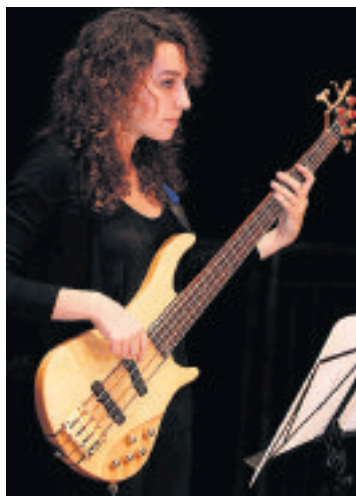
Musicians from the council music service THAMES performed during the evening