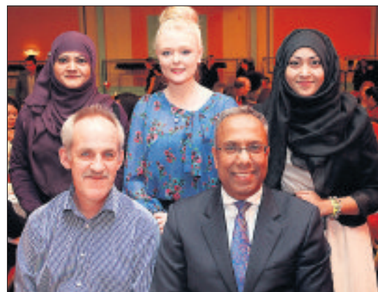
Guests and students with Mayor Rahman