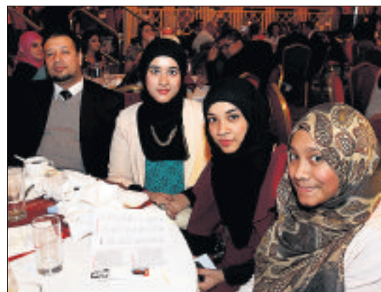
Guests and students after their meal

standing association with the good work carried out by the London Borough of Tower Hamlets in promoting the achievements of